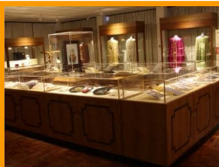
Chinese Catholic Museum 中國天主教文物館

為充分呈現其內涵，依藏品類別，以「人物」（于斌樞機主教、羅光總主教、田耕莘樞機主教、剛恆毅樞機主教、雷鳴遠神父等）、「禮儀服飾」、「禮儀用品」、「彌撒書籍」、「中國天主教教會史文獻史料」、「畫作」及「刺繡」等主題介紹。